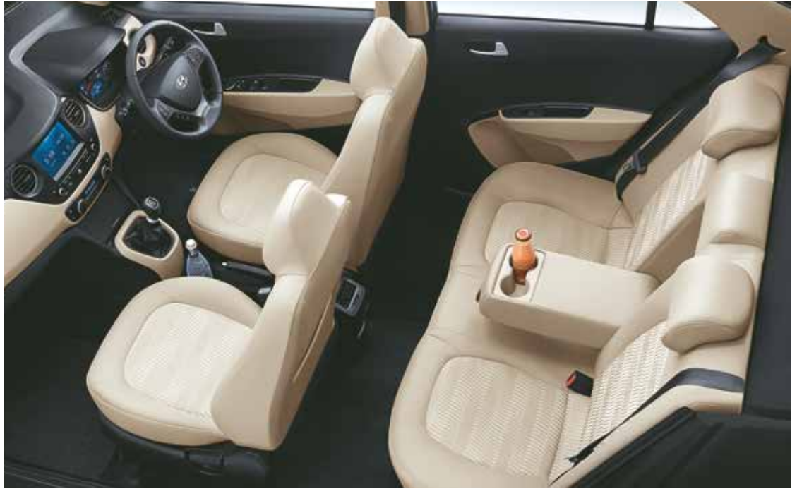
Bright and Spacious Interiors with New Seat Upholstery