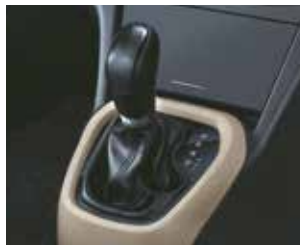
4-speed Automatic Transmission