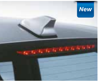
Shark Fin Antenna