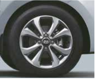
R15 Diamond Cut Alloy Wheels