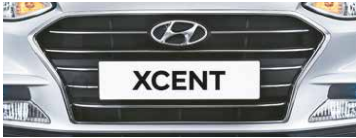
Hyundai Signature Cascade Design Grille with Chrome Slats

Rear Chrome Garnish | Electric Folding ORVM with Turn Indicator