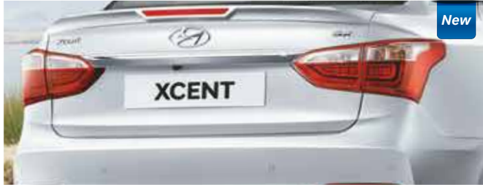
New Sporty Boot Lid Spoiler and Premium 2-Piece Wraparound Tail Lamps