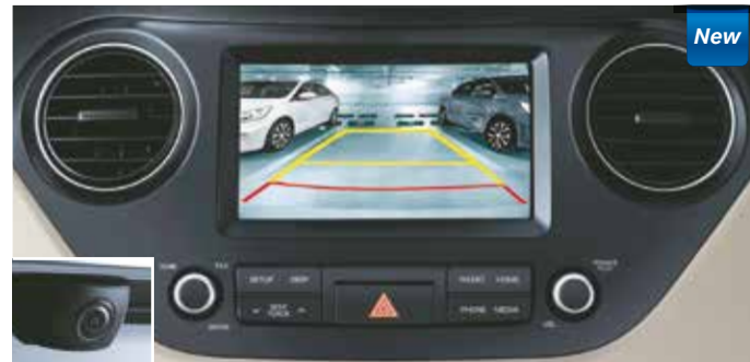
Rear Parking Assist System (with Display on 17.64cm Audio Screen)