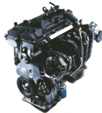
1.2l Kappa Dual VTVT Petrol Engine