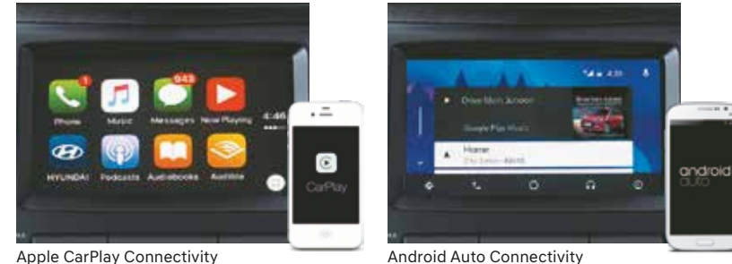
Apple CarPlay Connectivity