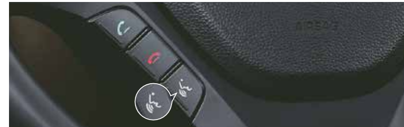
Voice Recognition Button on Steering