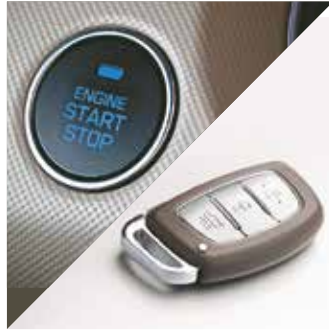
Smart Key with Push Button Start-Stop