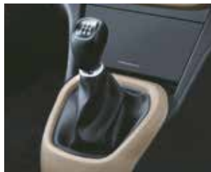
5-speed Manual Transmission

Whether you are negotiating the rush hour in the city or cruising on the highway with your family, the XCENT performs to perfection. With state-of-the-art petrol and diesel engines, it is highly responsive and very efficient.