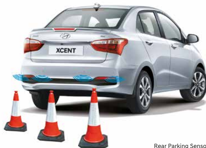
Rear Parking Sensors