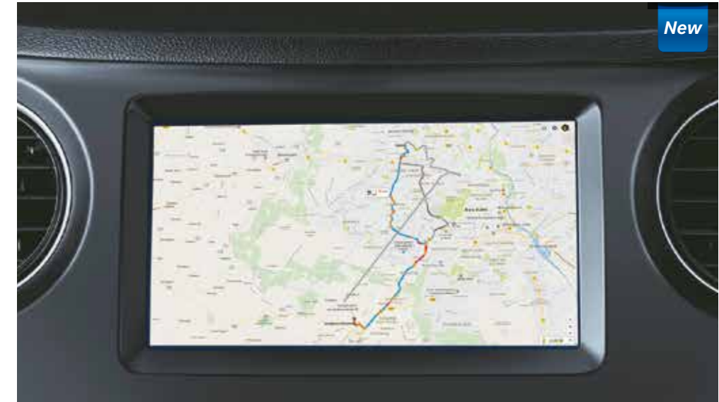
17.64 cm Touchscreen Audio Video System | MirrorLink | Smart Phone Navigation