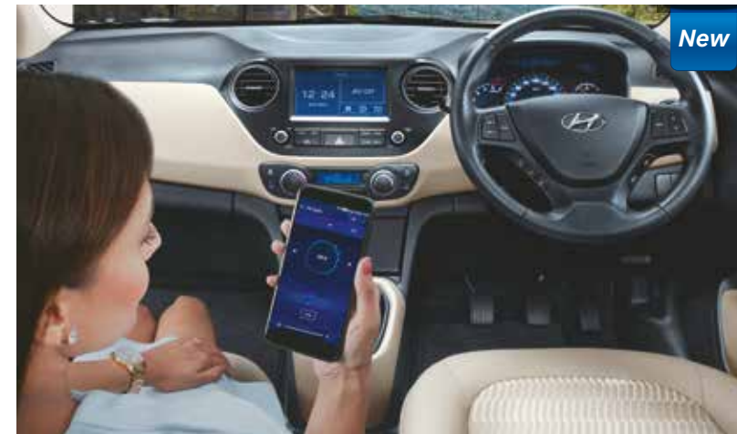
Hyundai iblue Smart Phone App for Audio Remote Control*

A class-leading 17.64 cm Touch Screen Audio Video System with smart phone connectivity, voice recognition and navigation support, gives the XCENT an advanced hi-tech imagery.