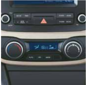
Fully Automatic Temperature Control